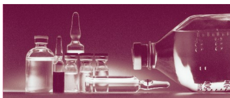
THERAPEUTIC DRUG MONITORING