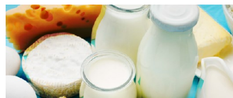
LACTOSE INTOLERANCE TEST