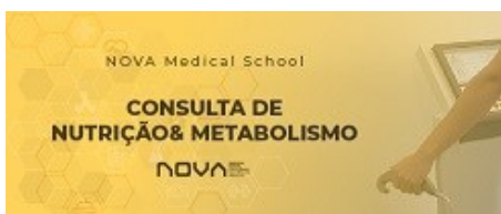
NUTRITION AND METABOLISM CONSULTATION (port)