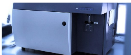
CLINICAL IMMUNOLOGY LABORATORY