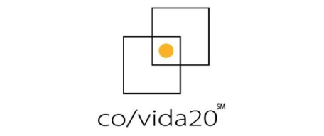
BUILDING QUALIFICATION (port)