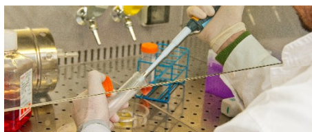
MOLECULAR BIOLOGY SERVICE