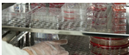
HELICOBACTER RESEARCH PYLORI